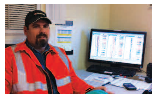
Hotwork digital data trend analysis

Hotwork has served clients operating industrial furnaces with more than 20,000 projects worldwide making it the largest and most experienced company in the field. We maintain 400 sets of portable equipment to address the most complex heatup and dryout projects and our highly specialized technicians are available to get the job done safely and correctly.