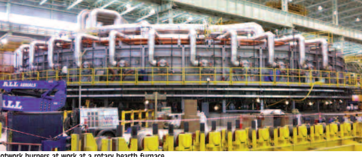
Hotwork burners at work at a rotary hearth furnac