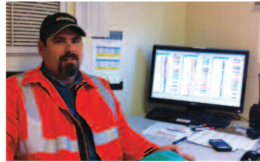
Hotwork digital data trend analysis

Over the past 45 years Hotwork has expanded considerably from its original North and South America license region. Hotwork now operates anywhere in the world