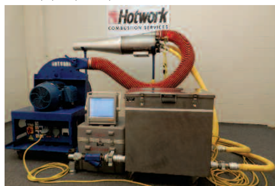
Hotwork's proprietary burner system

In the area of refractory dryout, Hotwork has no peer. Our proprietary burner is specially designed for refractory drying and helps to insure temperature ramps consistent with a refractory manufacturer's specifications. Proper dryouts result in