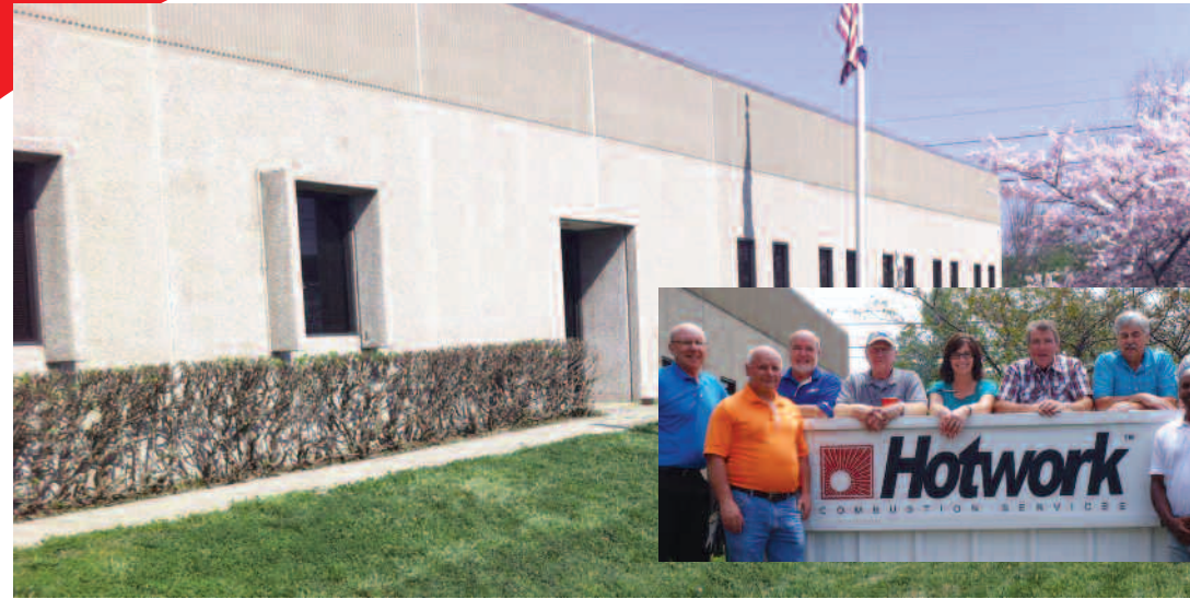
Hotwork's headquarters in Lexington, KY and our management team