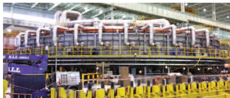
Hotwork burners at work at a rotary hearth furnace