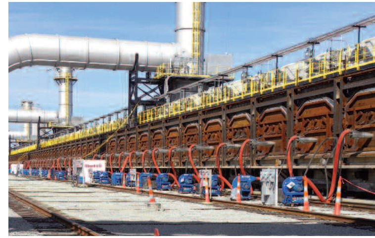
Heat recovery coke battery start up

and has subsidiaries in both Canada and Australia. Today you will recognize Hotwork-USA by the trademark, Hotwork®, the web address www.hotwork.com and by our Lexington, KY USA headquarters.